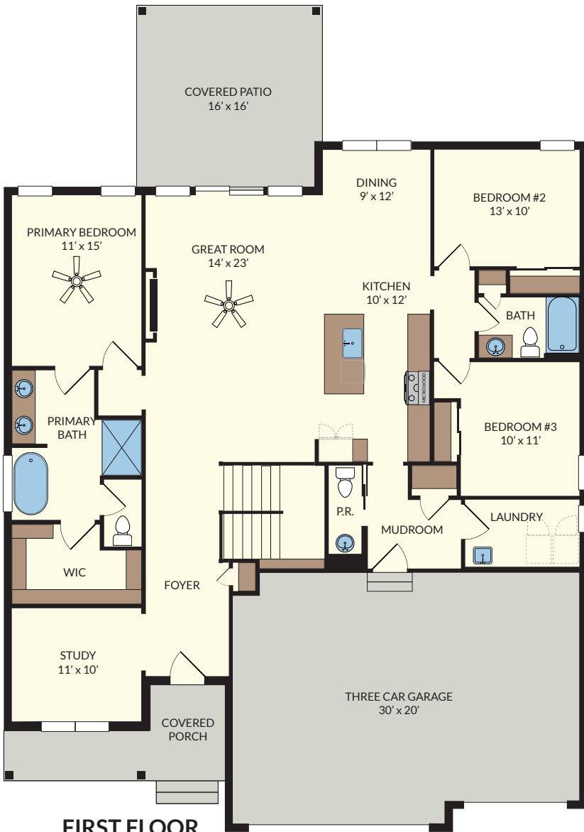
FIRST FLOOR 2,025 SQ. FT.